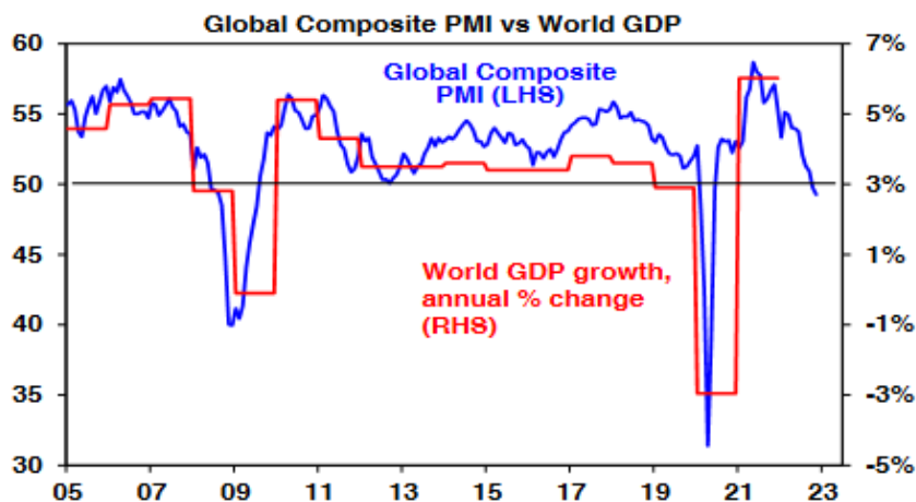
PMIs are surveys of business confidence and conditions.

hikes; the US has returned to divided Government with the risk of debt ceiling and funding standoffs; war continues in Ukraine; and tensions remain with China and Iran. Even Covid continues to disrupt – but mainly in China as cases surge as it reopens. These all suggest another volatile year and possibly continuation of the bear market in global shares.